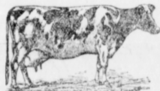
HOLSTEIN DAIRY FEED $25 a ton