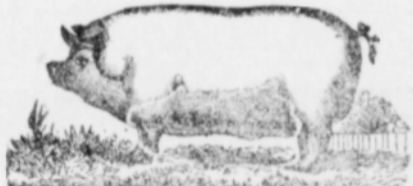
BERKSHIRE HOG FEED $35 a ton