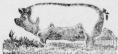
BERKSHIRE HOG FEED $35 a ton