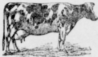
HOLSTEIN DAIRY FEED $25 a ton