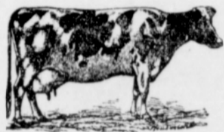
HOLSTEIN DAIRY FEED $25 a ton