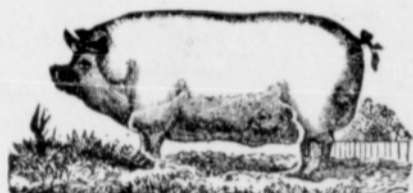
BERKSHIRE HOG FEED $35 a ton