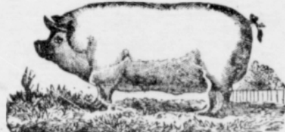
BERKSHIRE HOG FEED $35 a ton