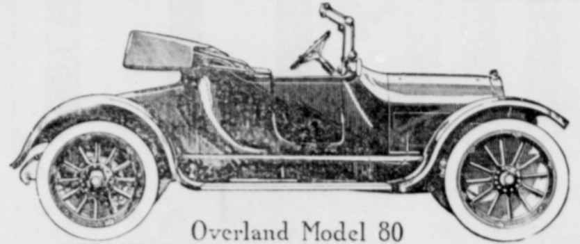
Overland Model 80

OVERLAND MODEL 80 TWO-PASSENGER ROADSTER Price $1175 at Gresham Motor: 4 cylinders, cast singly. Bore: 4 1/4 inches. Stroke: 4 1/2 inches. 35 Horsepower. Wheelbase: 114 inches. Tires: 34x4 inches, demountable rims. Full streamline body. Floating type rear axle. Electric starting and lighting. Left-hand drive. Brewster green with ivory striping.