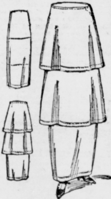
8211 Two-Piece Flounced Skirt, 22 to 30 waist, WITH OR WITHOUT RUFFLE.

Everything that flares to produce a wide effect to the skirt is fashionable. This one is made with two circular flounces. It is very simple and very smart and it can be treated in a number of different ways. As shown here, it is all of one material but the flounces could be made of plaid or other fancy material while the skirt is plain, or, if the material is heavy and it is desirable to reduce the weight, thin silk can be used for the skirt beneath the flounces while the lower portion only is of the material. The model is a good one for all reasonable materials. The heavier ones will require only to be stitched on the edges, the lighter ones, such as taffeta and other silks, can be finished with little plaitings of ribbon of narrow ruchings of the material or in any manner that tends to give the effect of fullness at the lower edges.