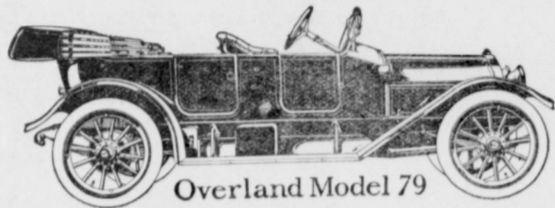
Overland Model 79