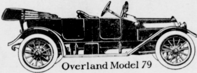
Overland Model 79