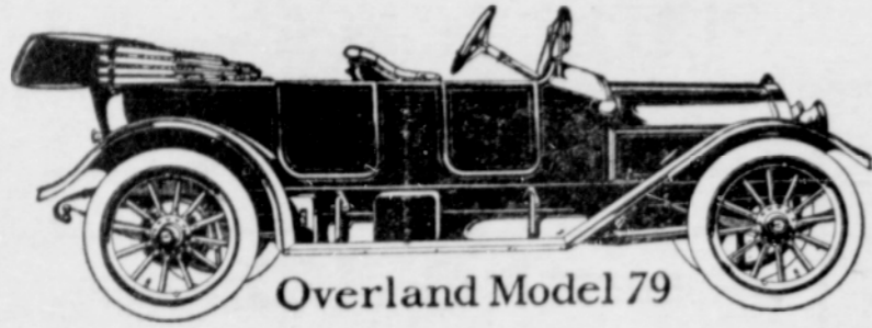
Overland Model 79