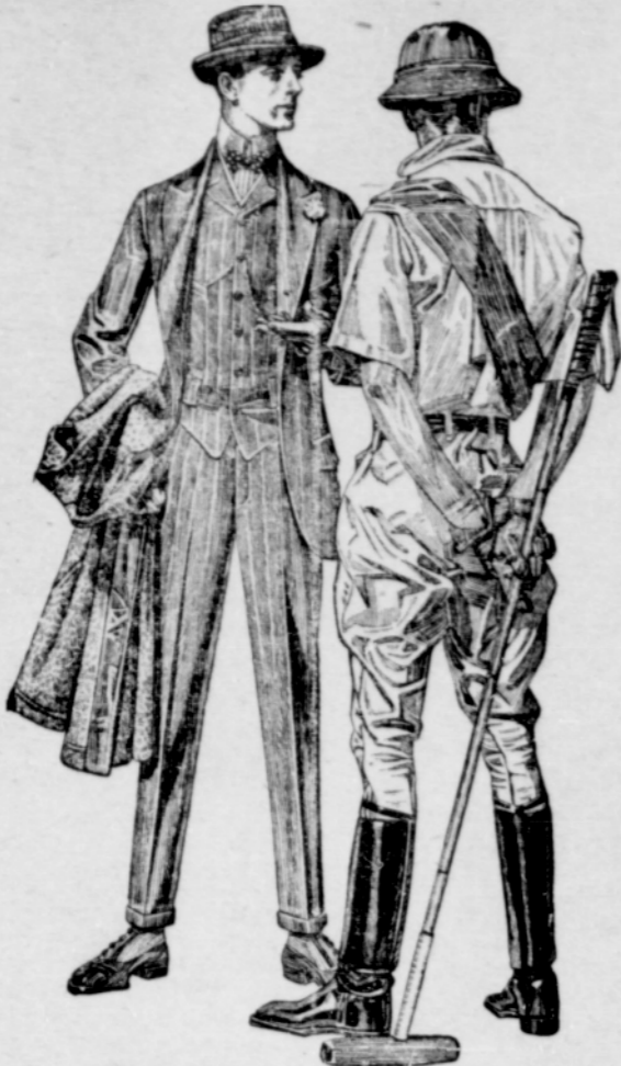
Copyright 1913 The House of Kuppenheimer

TO MEN and Young Men who have purchased their clothing here in seasons past, an announcement that the new Summer Styles from