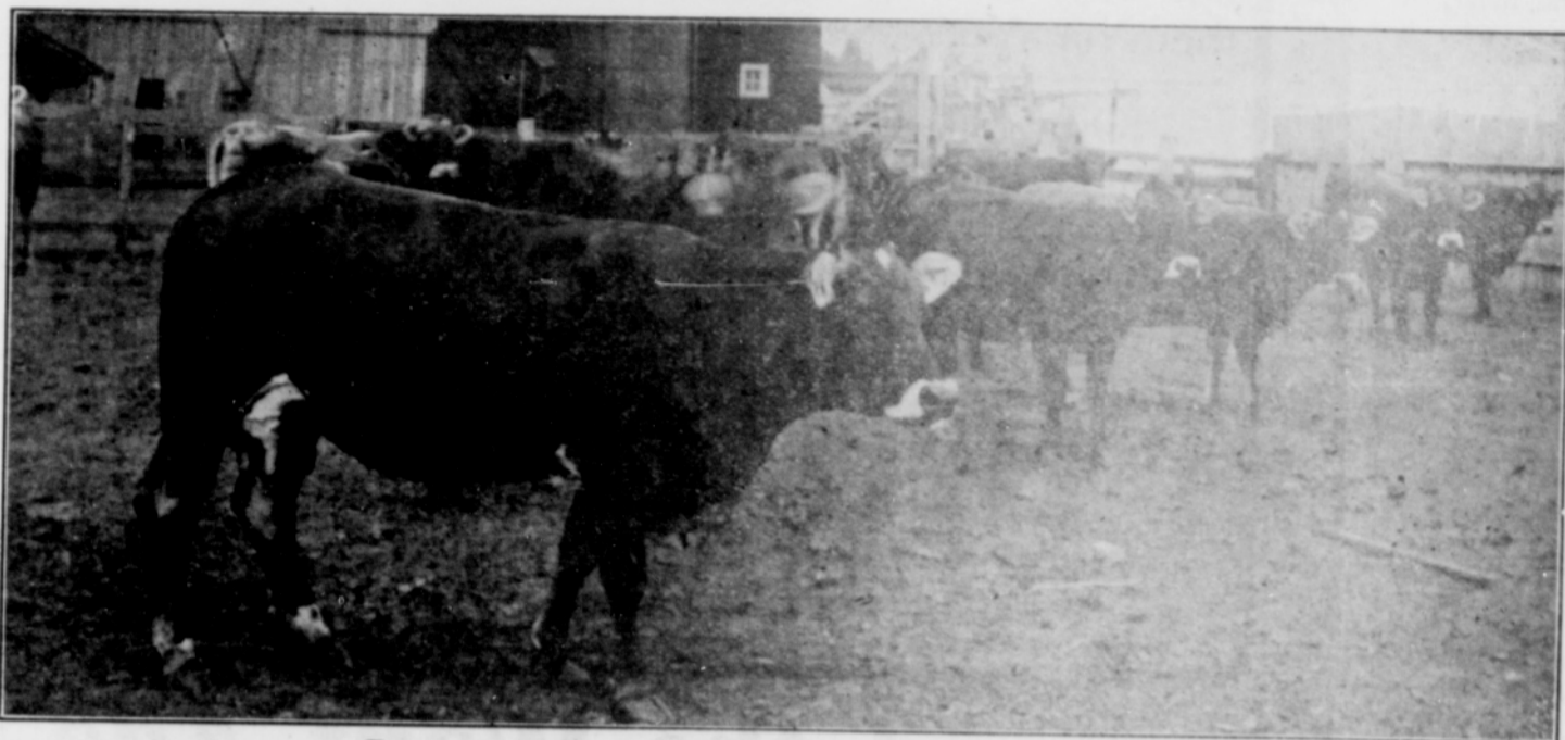
Theodore Brugger's Dairy Herd Now on Exhibition at the Fair Grounds