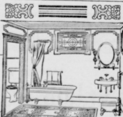
A "Standard" Modern Bathroom. A DAINTY BATHROOM