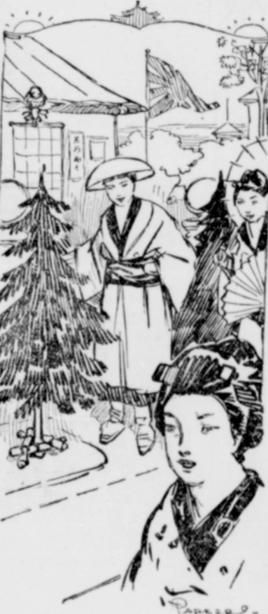
THE STREETS RESEMBLE WINDING AVENUES OF CHRISTMAS TREES.

For weeks before the dawn of Christmas day preparations elaborate in kind and degree are under way. Men in tight fitting costumes, their professions, or the contractors' names printed on their backs, spend day after day decorating the streets and houses. Stands for the lanterns and the festive greenery must be erected, and a thou-