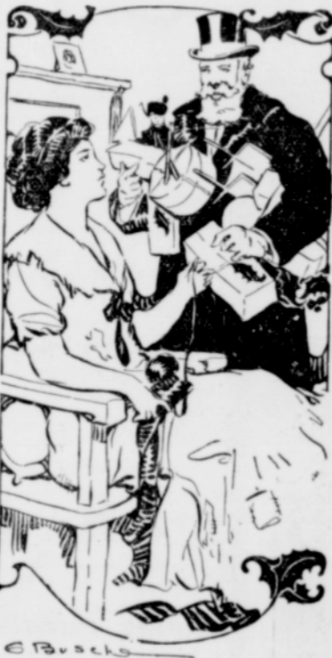
"MADAM, I AM SANTA CLAUS."

"You are like the picture in my book," said the boy—"a fat old gentleman, with a long white beard and lots of parcels. And my mamma said Santa Claus wouldn't come to our