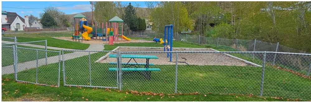
Heppner City Park. -Contributed photo