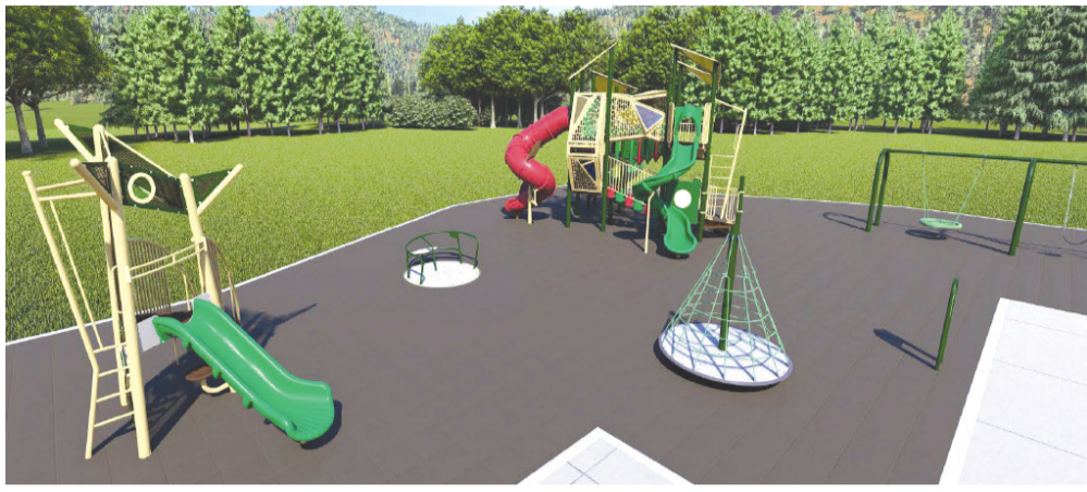
A designer's rendition of what the park remodel could look like.

The City of Heppner is a step closer to its fundraising goal for a remodel of Heppner City Park courtesy of a $20,000 grant from the Wildhorse Foundation.