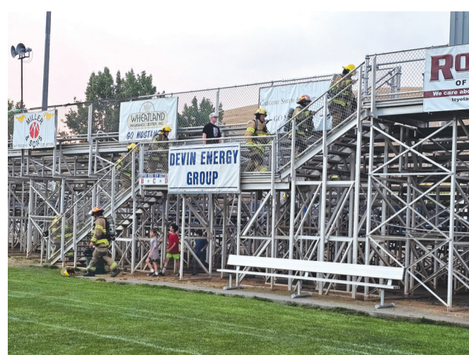
Firefighters and locals participating in the stair climb.

Heppner Fire Department and their annual 9/11 Memorial Stair Climb held on September 16, 2024. Firefighters re-enacted the climbing of the 110-story World Trade Center, wearing full gear. There were participants from Heppner Fire Department, Lone Rural Fire, Lexington Fire, and visitors from Irrigon Fire (hope I didn't miss anyone.) Thank you to all our firefighters from all agencies! Thank you for those who attended and supported the evening.