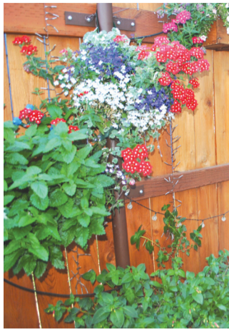
A section of the Nairns yard.