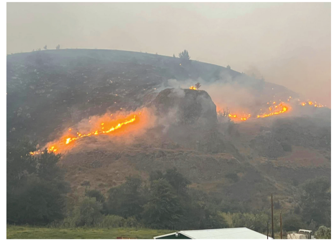
Fire above the family ranch home.