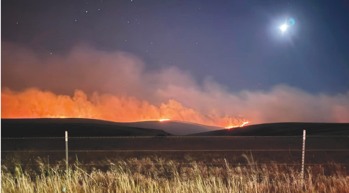
Lone Rock Fire approaching Hardman, Oregon Sunday night July 14th.