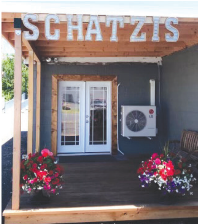
Schatzi's Mane Attraction