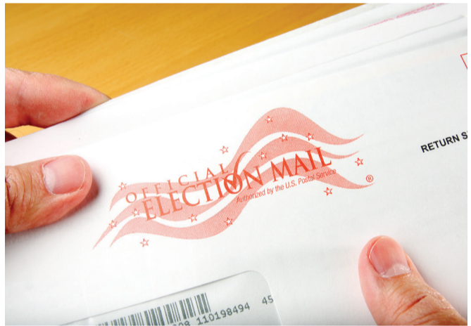
- Contributed Image