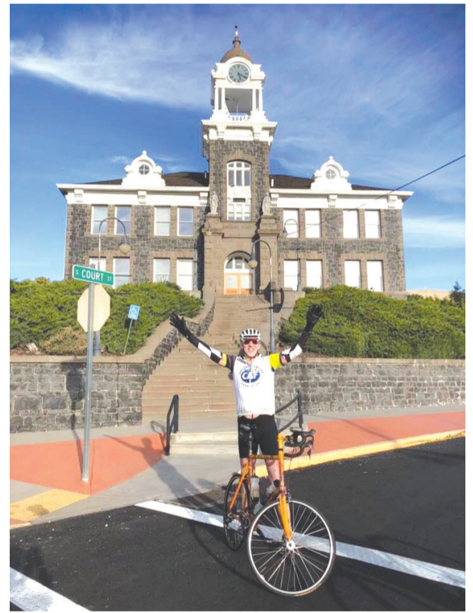
Bill Walton in front of the Morrow County Courthouse, Heppner 2018.

An American professional basketball player and television sportscaster. He played college basketball at the University of California, Los Angeles (UCLA) and in the NBA for the Portland Trail Blazers, San Diego / Los Angeles Clippers, and Boston Celtics. He is a member of the Naismith Memorial Basketball Hall of Fame and the Nation-