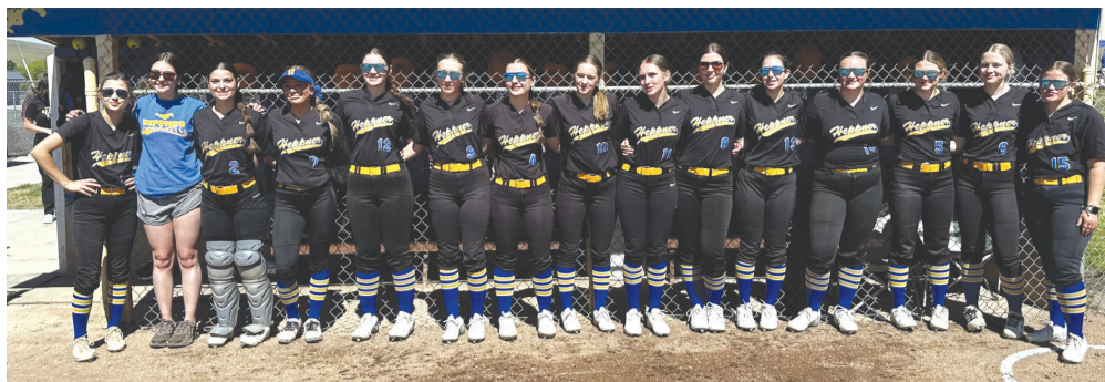
Heppner High School team.

Heppner Softball had a first-round bye. The second-round game will be at Oakland High School on Wednesday, May 22nd at 1:00 pm. The Mustangs