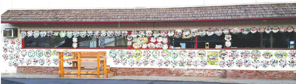
Names and photos hung up along the remembrance walk.

Here we are again... it's time to dust off those ghillies (or kicks, rather), gather all your green garb, get your heart rate going and get together with your old friends and family for a walkabout, in memory or your loved ones.