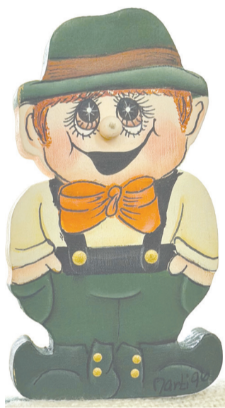
Fiddle the Leprechaun

Visit select Main Street locations in Heppner, March 1st-14th and look for "Fiddles the Leprechaun" for a chance to win $100! Each day the 4.5" tall leprechaun will be hiding in a different business. All you need to do is take a picture of yourself with him in the background and text it to 541-256-2300 with your first and last name. You may enter once each day until the contest ends on March 14th. The drawing winner will be announced on Friday, March 15th! Check the Heppner Chamber of Commerce Facebook page for a schedule of locations!