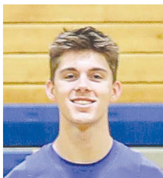
Landon Mitchell