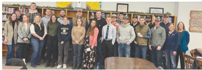
The Heppner High School Alumni posing together after speaking with the HHS kids.