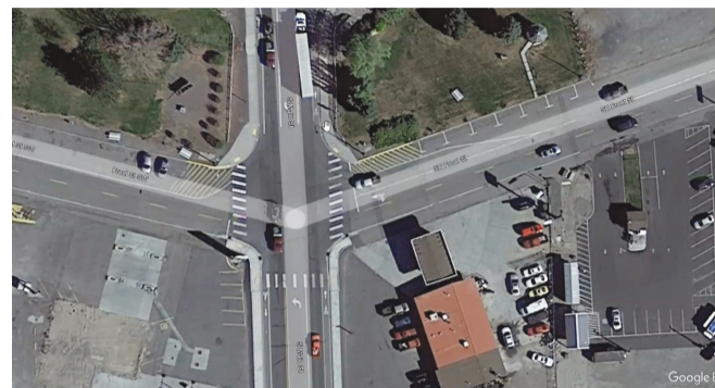
A google map view of the intersection S Main st and Front St.