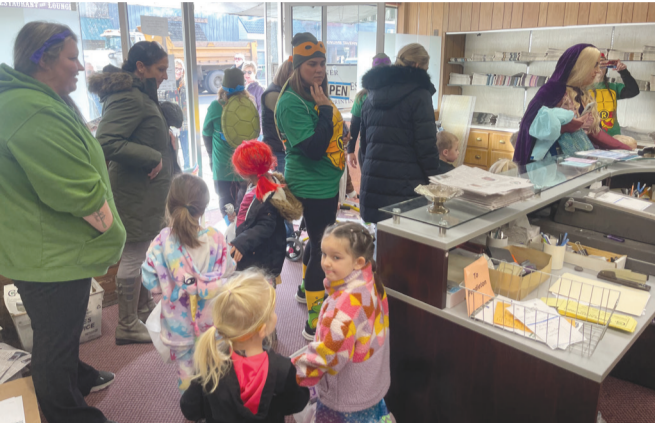
Parents dressed as the Teenage Mutant Ninja Turtles help guide Heppner Daycare students to get candy.