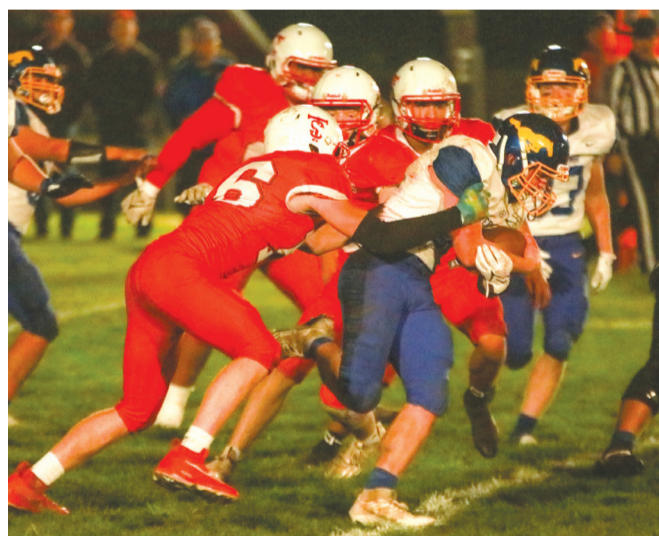
Mustang runner dragged down by multiple Tigerscots Friday night.

Weston-McEwen had 252 total yards in the game.