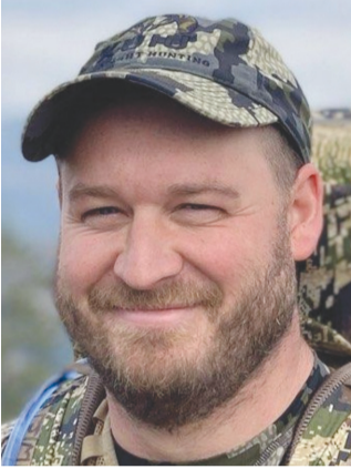
Ian Murray - Contributed Photo

In particular, he has been working to wrap up the HB 2017 street project and the Oregon Dept. of Transportation's ongoing curb project, as well as