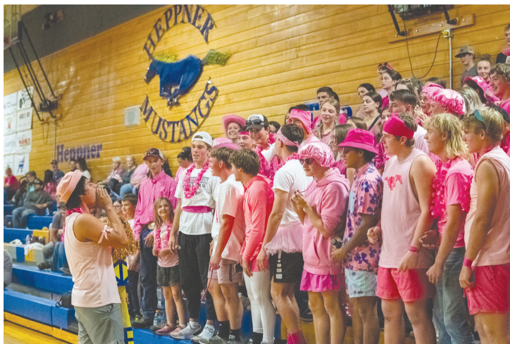
Students cheering on Heppner Volleyball team.