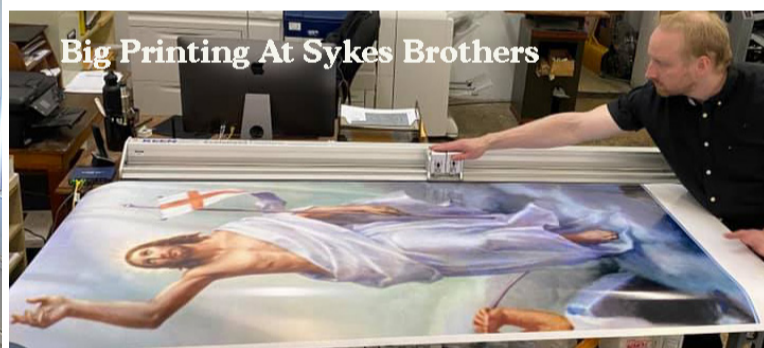
Big Printing At Sykes Brothers

Vinyl Banners High-Quality Custom Vinyl Banners