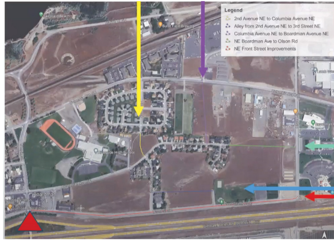
Proposed projects of the North Boardman URA. -Contributed