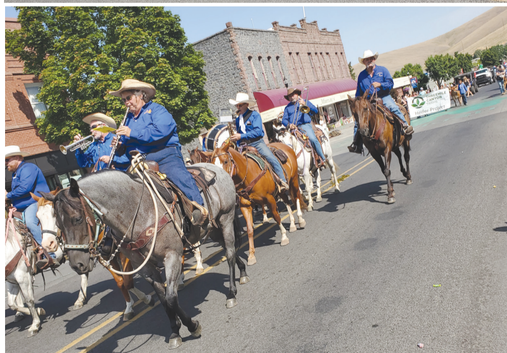
The Morrow County Fair and Rodeo Parade will wind its way through Heppner Saturday, Aug. 19, at 10 a.m. Residents and visitors are invited to line Main Street and enjoy the pageantry of one of Morrow County's most treasured traditions. For more information on entries, contact the Heppner Chamber of Commerce.

THANK YOU to all our donors from 10U Columbia All Star team!. Your generosity is greatly appreciated! This gave the kids a great opportunity to represent our communities doing something they love!