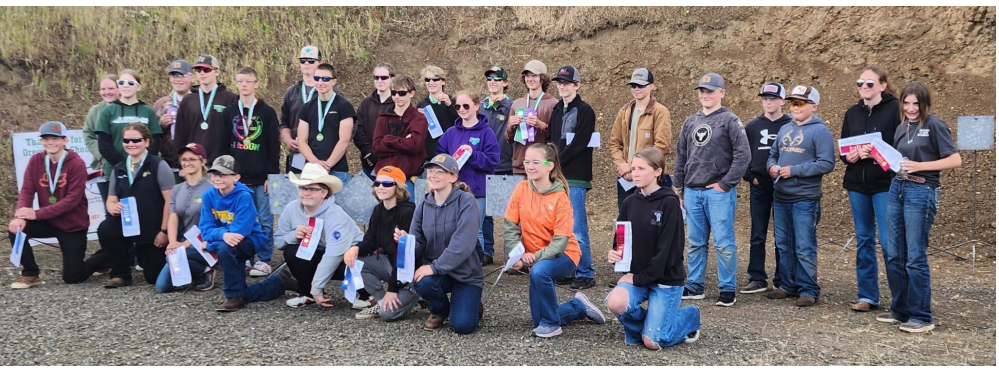
Archery contestants from around the state during the awards ceremony at the Oregon 4-H Shooting Sports State Championships last week.

Several Morrow County 4-H members made the trip to Albany for the Oregon 4-H Shooting Sports Championships last week, bringing home ribbons and bragging rights in various disciplines. Of the 16 Morrow County youth who qualified in four different shooting disciplines, nine chose to take their shot at the bullseye in the state