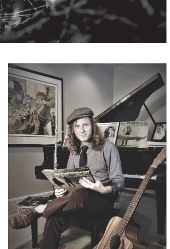
One Trick Pony

The concerts are free 7 p.m. on Monday nights. Visitors are encouraged to