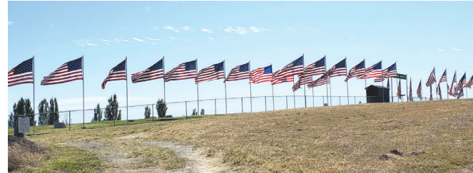
Row of flags