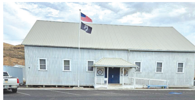
American Legion Hall Post 95 Ione, Oregon