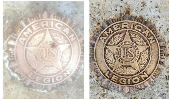
Restored American Legion Logo