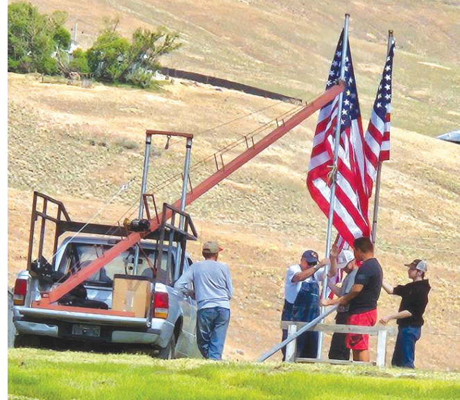
American Legion and community members put up flags for Memorial Day.