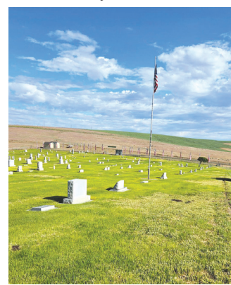
The permanent flag pole at High View Cemetery

cleaning and restoring the plaque beneath the flagpole. It took around four hours to scrub, clean and remove rust from the plaque. Recently, post members have also built a new ramp, overhang, gutter and steps, and have put up lights for the building.