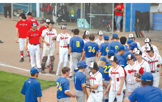
The Heppner Mustangs and Weston-McEwen/Griswold shake hands after tough battle.

The Heppner/Ione Mustang baseball team took second in district playoffs after a close 3-2 loss to Weston-McEwen/Griswold in an extra-inning game last Tuesday in Heppner. Despite the loss, the Mustangs now head into state playoffs in a strong position. The Mustangs received a bye on round one of the 2A/1A state playoffs, which