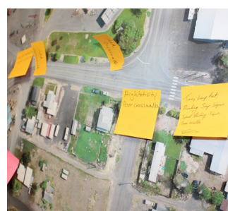
Lexington residents used sticky notes to highlight problem areas on Main Street.