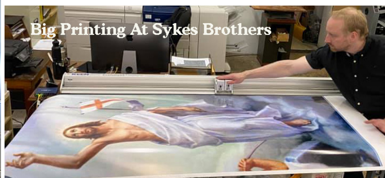
Big Printing At Sykes Brothers

Vinyl Banners High-Quality Custom Vinyl Banners