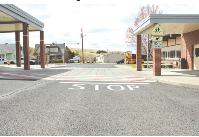
Stansbury Street in Heppner may soon be closed for a couple of hours during school days for student safety.