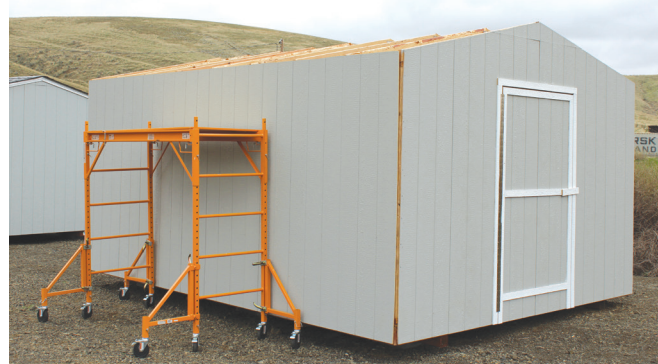
A student-built shed in progress at Ione High School.