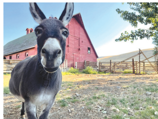
This donkey at Red Barn Farm is only one of the friendly faces visitors will see at the South Morrow Farm Crawl in June.

For anyone looking to learn more about local agriculture, there's probably no better way than the farm crawl.