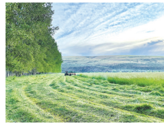
Haying in progress at Red Barn Farm.