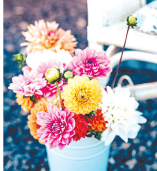
South Morrow Farm Crawl participants will see a variety of local agricultural enterprises ranging from livestock to wheat to flowers like these dahlias.