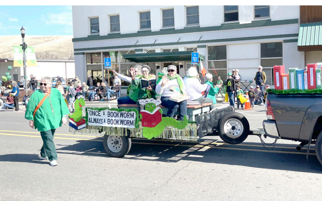
Heppner Bookworms parade float.

The Heppner St. Patrick's Committee has announced the winners of the 2023 Great Green Parade. Winners are as follows: Irish Themed Business Float: Morrow County Soil & Water District.