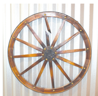
A wheel with a broken spoke, the restaurant's namesake.