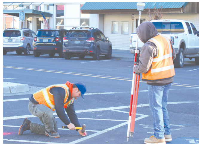
Surveyors work on Main Street in Heppner as part of a larger ODOT project that includes altering sidewalk wheelchair ramps.