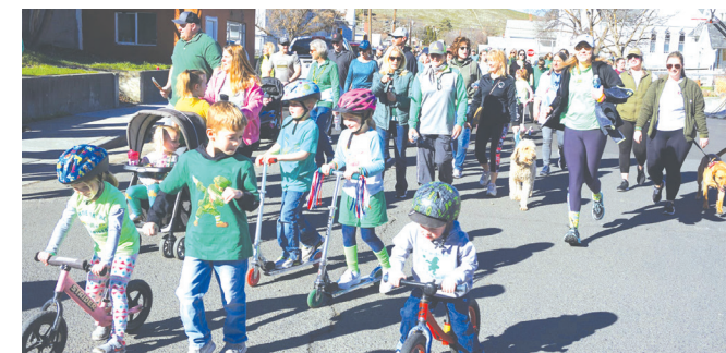
Participants in the 2022 Friends Helping Friends Remembrance Walk. The event is returning this year during Heppner's Wee Bit O' Ireland Celebration March 18.

Dust off those walking/running shoes and get a jump start to all the family fun during Heppner's Wee Bit O' Ireland St. Patrick's Day Celebration. Friends Helping Friends will again be hosting the St. Patrick's Day Remembrance Walk and 5k run on Saturday, March 18. Registration and a social hour will begin at 8:30 a.m.. The walk and 5k run will begin at 9:30 a.m. following the annual group photo.