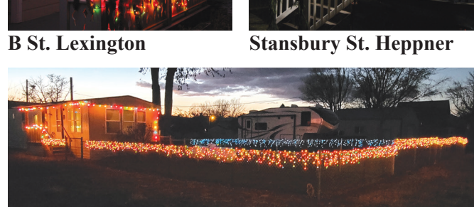
Arcade St. Lexington