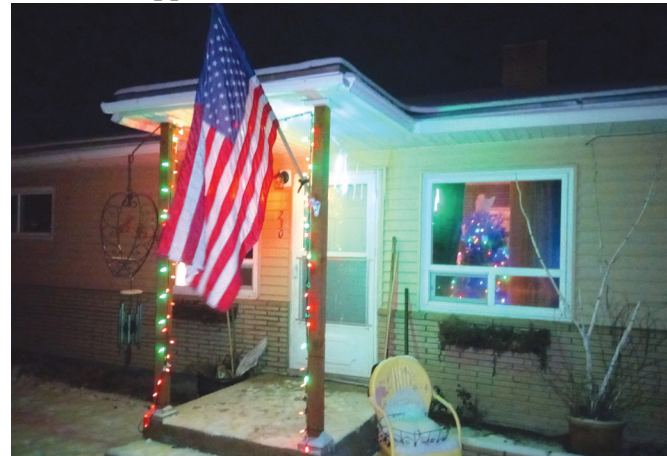
Water St. Heppner