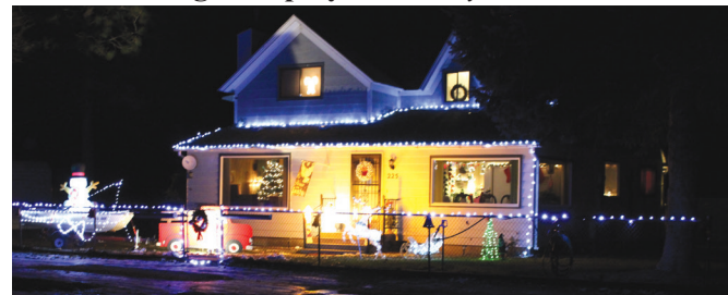
Arcade St. Lexington