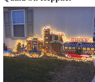
Ployhar light display Hermiston - Photo by Bob Ployhar