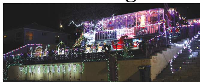
Gilmore St. Heppner