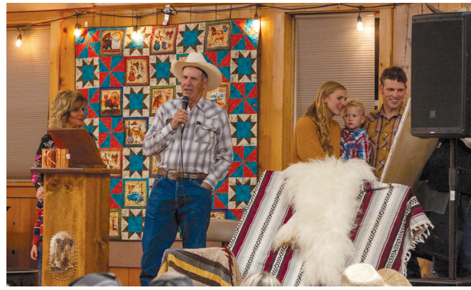
Last Saturday's Oktoberfest in support of the Woolery Project was deemed a success.

Attendees said it "felt like home" this past Saturday in Ione, as The Woolery Project enjoyed the warmth and generosity of guests from around the region. The eighth annual Oktoberfest Dinner and Auction was in support of the project and has put the project that much closer to building The Woolery on the bluff above Arlington.