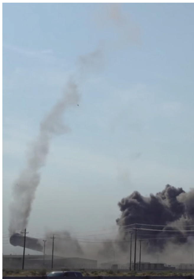
A demolition contractor imploded the smokestack and boiler building at Portland General Electric's shut down coal-fired power plant near Boardman last Thursday