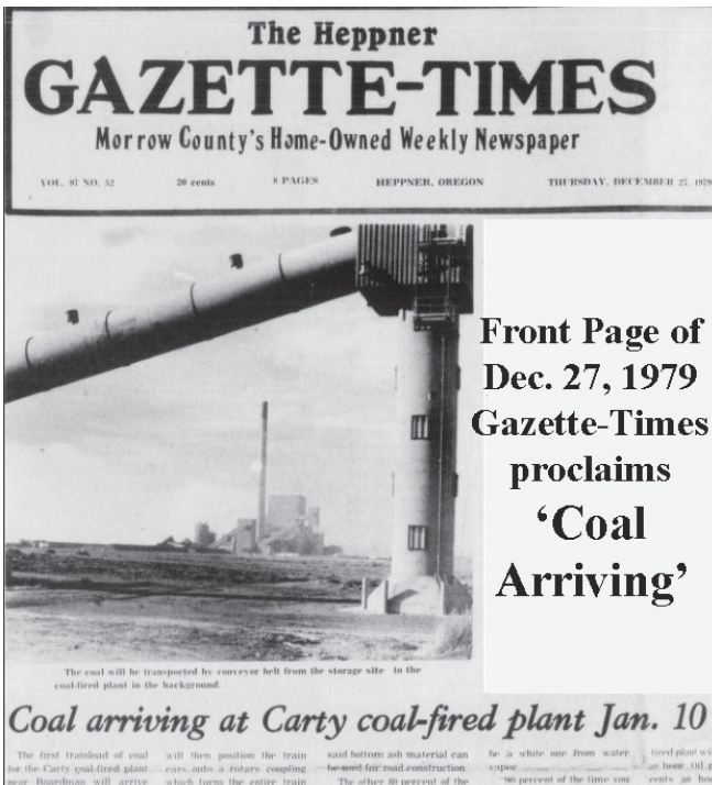
Front Page of Dec. 27, 1979 Gazette-Times proclaims 'Coal Arriving'