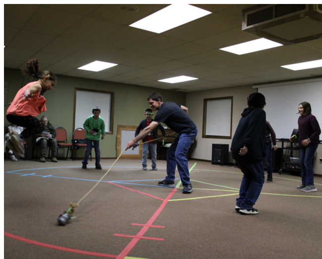
Enjoying activities at AWANA Club

Meetings will be held from 6 p.m. to 7:30 p.m. on Tuesdays throughout the club year. Every week includes a different theme; club members can start