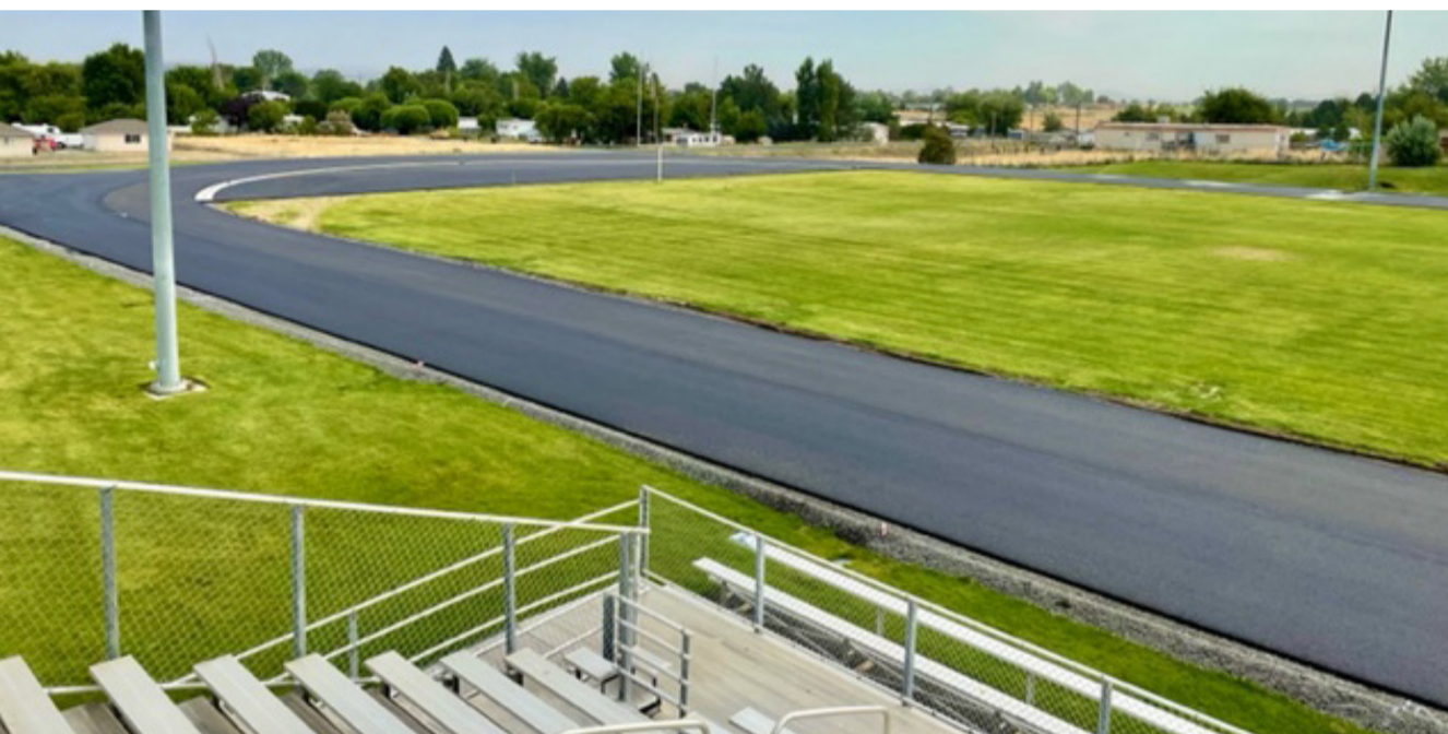
One big improvement is the new track currently under construction at Irrigon Junior-Senior High.