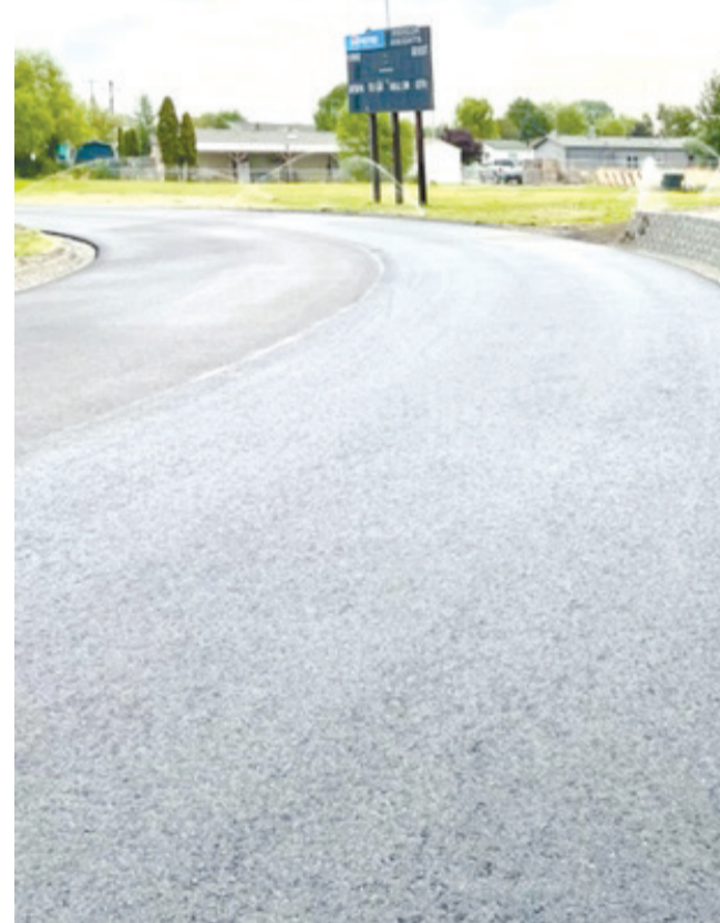
Currently, there is a three-inch deep base layer of asphalt, which will be covered in the next phase with a synthetic rubberized surface.

everything they provided in making this project happen."