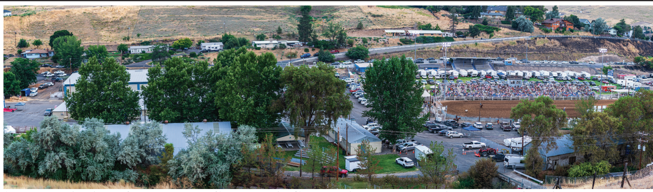
A panoramic view of the Morrow County Fair Grounds in Heppner during this year's Fair and Rodeo week. See pages 6 & 7 for more photos of Fair and Rodeo

VOL. 141 NO. 34 8 Pages Wednesday, August 24, 2022 Morrow County, Heppner, Oregon