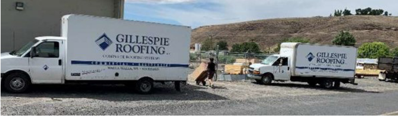
The Ione School District Elementary roof project was completed by Gillespie Roofing at the end of July

The Ione School District Elementary roof project was completed by Gillespie Roofing at the end of July, the district reported. According to the district, there will still need to be some modifications to gutters and downspouts, and that work will happen in the near future. Gillespie roofing identified areas of moisture through testing, and they were able to replace damaged areas while completing the installation of the new membrane and metal flashing. Anderson Poolworks has provided an evaluation of the existing pool structure and equipment as of July, and they reported that the existing pool structure is in good shape. They proposed small repairs to the pool structure as well as a complete piping and equipment replacement to move all mechanical parts above ground and in one location.