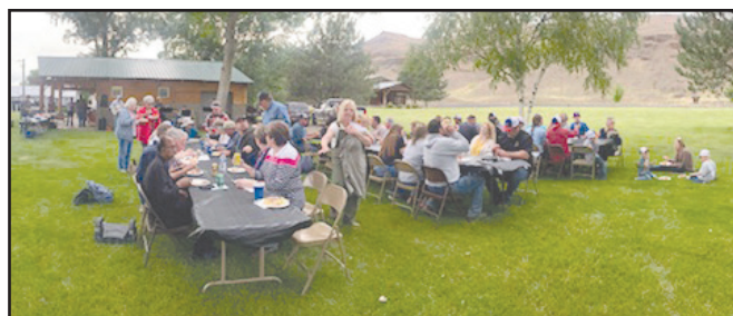
The annual OSU Extension and Oregon Wheat Growers League Morrow County Crop Tour, ended with dinner in the Ione City Park. The event saw 75 growers and their families attend.