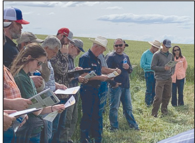
Local farmers and OSU Extension faculty tour south Morrow County evaluating grain varieties and input applications options during the OSU Extension and Oregon Wheat Growers League annual crop tour on June 16.