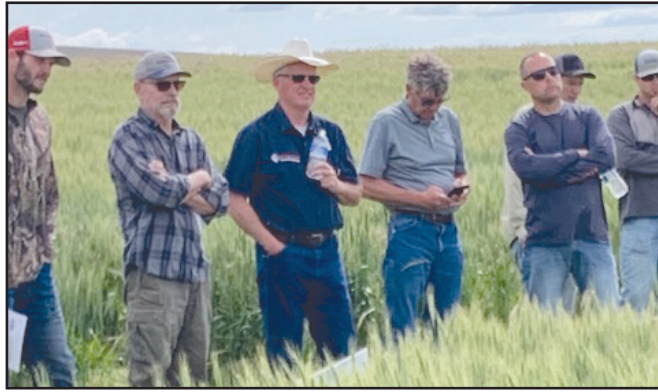
Local wheat growers, beginning and experienced, revel in the opportunity to learn about the results of research completed by OSU Extension in Morrow County.