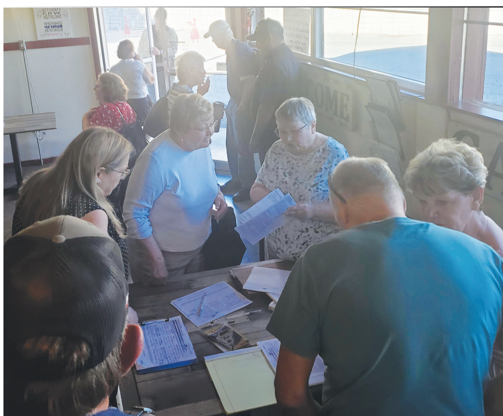
Volunteers pick up signatures sheets to begin gathering the necessary 564 to force a recall election.