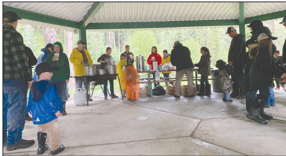
Kids from 0 to 14 years old participated in the annual fishing derby held at Cutsforth Park, despite the wet weather.